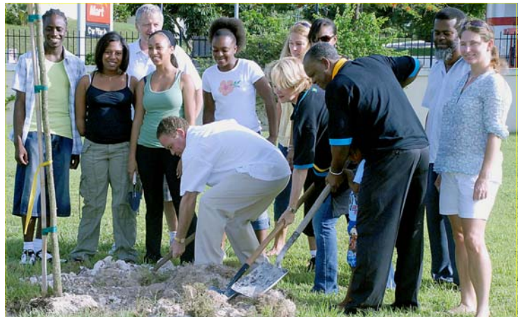
This picture shows The United World College Committee (Bahamas) planting one of the fifty (50) trees to be planted on the grounds of the Ministry of Education. Pictured (left) Minister of Education, Hon. Carl Bethel shovelling, next Mrs. B.J Deveau, Chairperson UWC (Bahamas) and (right) Hon. Earl Deveau Minister of Environment.