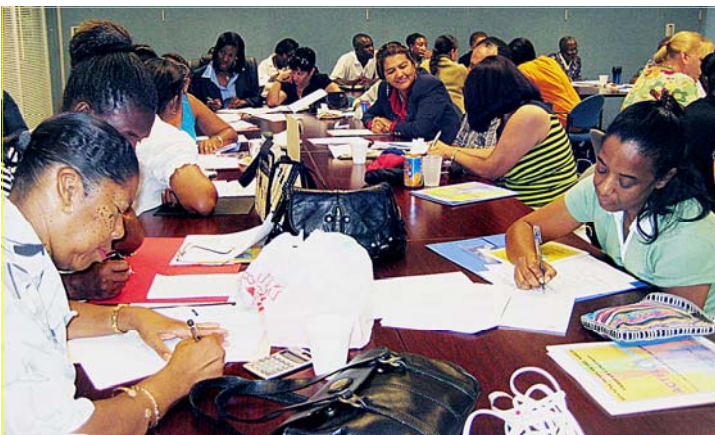
Modern Language teachers attend workshop under the theme: "Opening Minds to the World through Languages." held in the Ministry's ground floor Conference Room.