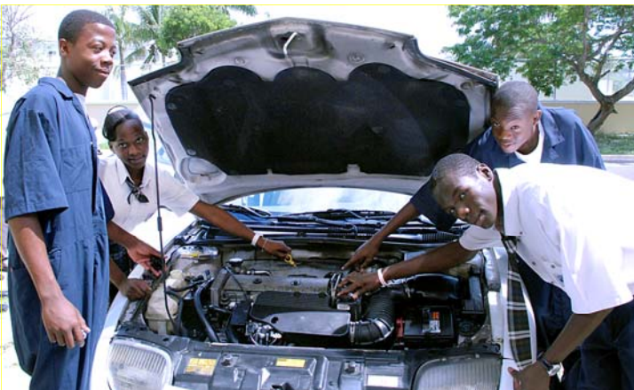
C. V. Bethel Senior High School's Technical students recently presented a car which they had repaired and refurbished over the past semester to the Department of Education.