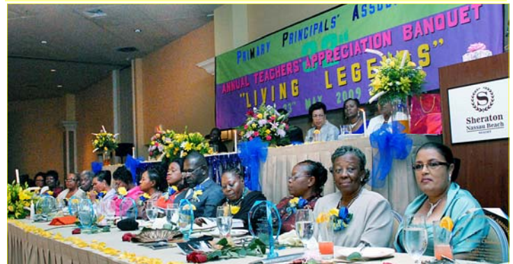
Primary Principals' Association 32nd Annual Teachers' Appreciation Banquet held at Sheraton Cable Beach under the theme "Living Legends".