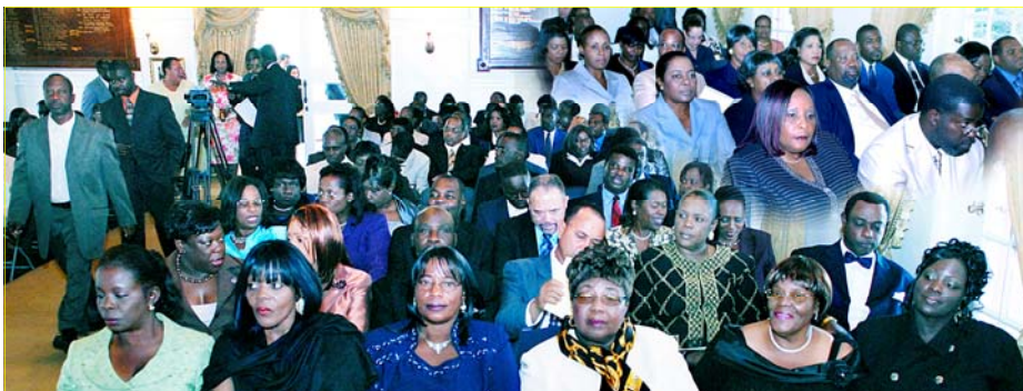
Pictured are the 81 graduates of The College of The Bahamas Institute for Education Leadership Programme who were pinned by His Excellency, The Honourable Arthur Hanna, Governor General at a ceremony held at Government House.