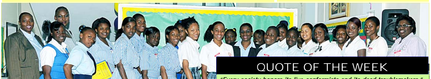
Pictured are High School Students who participated in the Speech Therapy Career Orientation Exercise held at Ministry of Education.