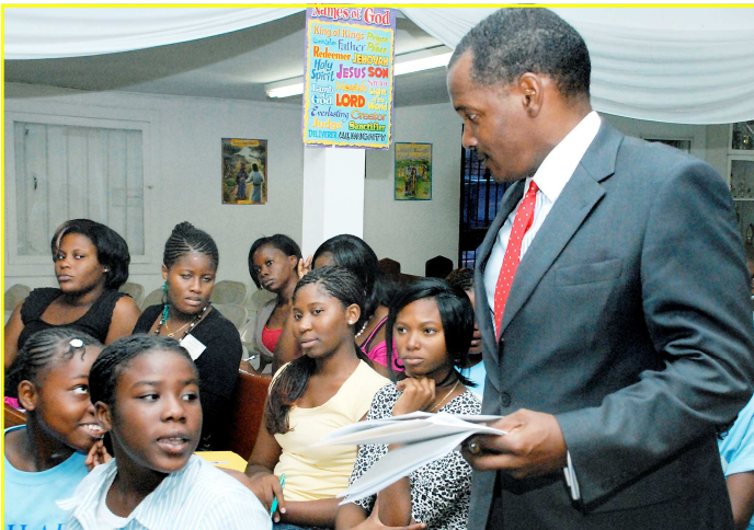
Minister of Education, the Honourable T. Desmond Bannister held an interactive session with students at a Youth Seminar, hosted by the United Haitian Bahamian Association.