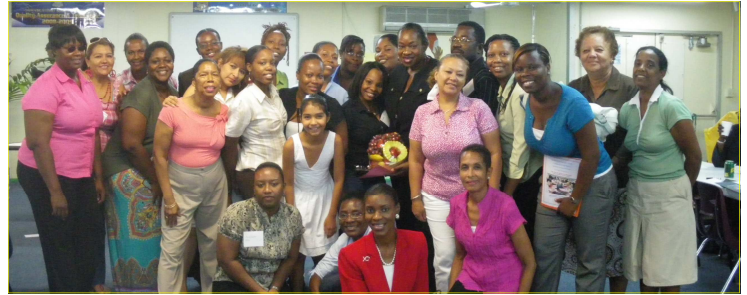
Modern Languages teachers pause to take a photo at their annual Summer Workshop before getting ideas on how to add excitement and variety to their instructional practices.