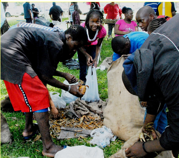
Students of the Mangrove Cay Community raised some 5,000.00 dollars in the "Crabs For Computers" Initiative. The students hope to purchase laptops to assist with their studies.

► Contact Mrs. Aletha Cooper in Communications with info on upcoming events and activities. (Ph: 502-2787 or 502-2788).