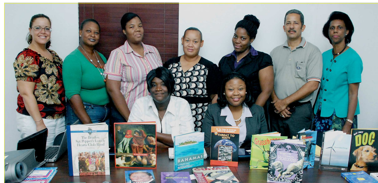
Book display held during Annual Basic Library Training Workshop for new library staff in New Providence and Family Island Public Libraries.