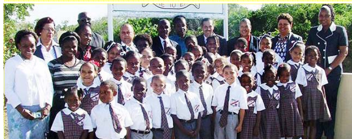
Minister of Education, The Hon. T. Desmond Bannister accompanied by The Hon. Lawrence Cartwright, Minister of Agriculture and Marine Resources and Member of Parliament for the island along with senior education officials recently toured schools in Long Island (Back row 4th right) to speak with staff and students. They are pictured with the students at Morrisville Primary School. (Photo by Valerie Gaitor).

If all pulled in one direction, the world would keel over. - Yiddish Proverb.