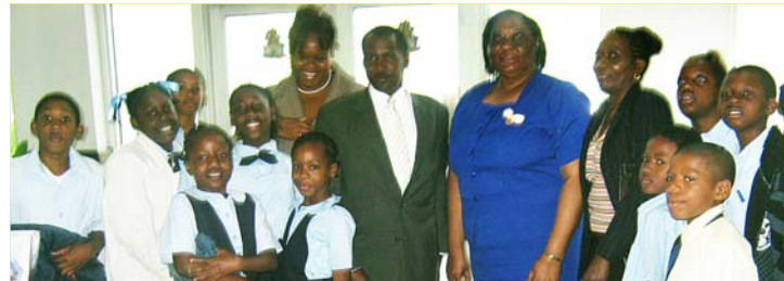
Students from Primary Schools on Cat Island accompanied by their teachers and other educators paid a courtesy call on the Minister of Education, The Hon. T. Desmond Bannister.