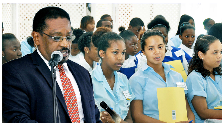
The Honourable Dr. Hubert Minnis Minister of Health and (Acting Minister of Education) encouraged students attending the 3rd Annual Student Hospitality Conference to become lifelong learners, and to prepare themselves well for the highly competitive tourism industry through a Johnson & Wales University education.