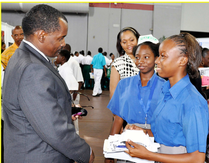
Minister of Education, the Honourable T. Desmond Bannister shares his thoughts on embracing employment opportunities with students at the National Career Awareness Month (NCAM) fair, which was held under the theme: "Empowerment, Education, Entrepreneurship, Excellence: The Keys to Career Satisfaction.".